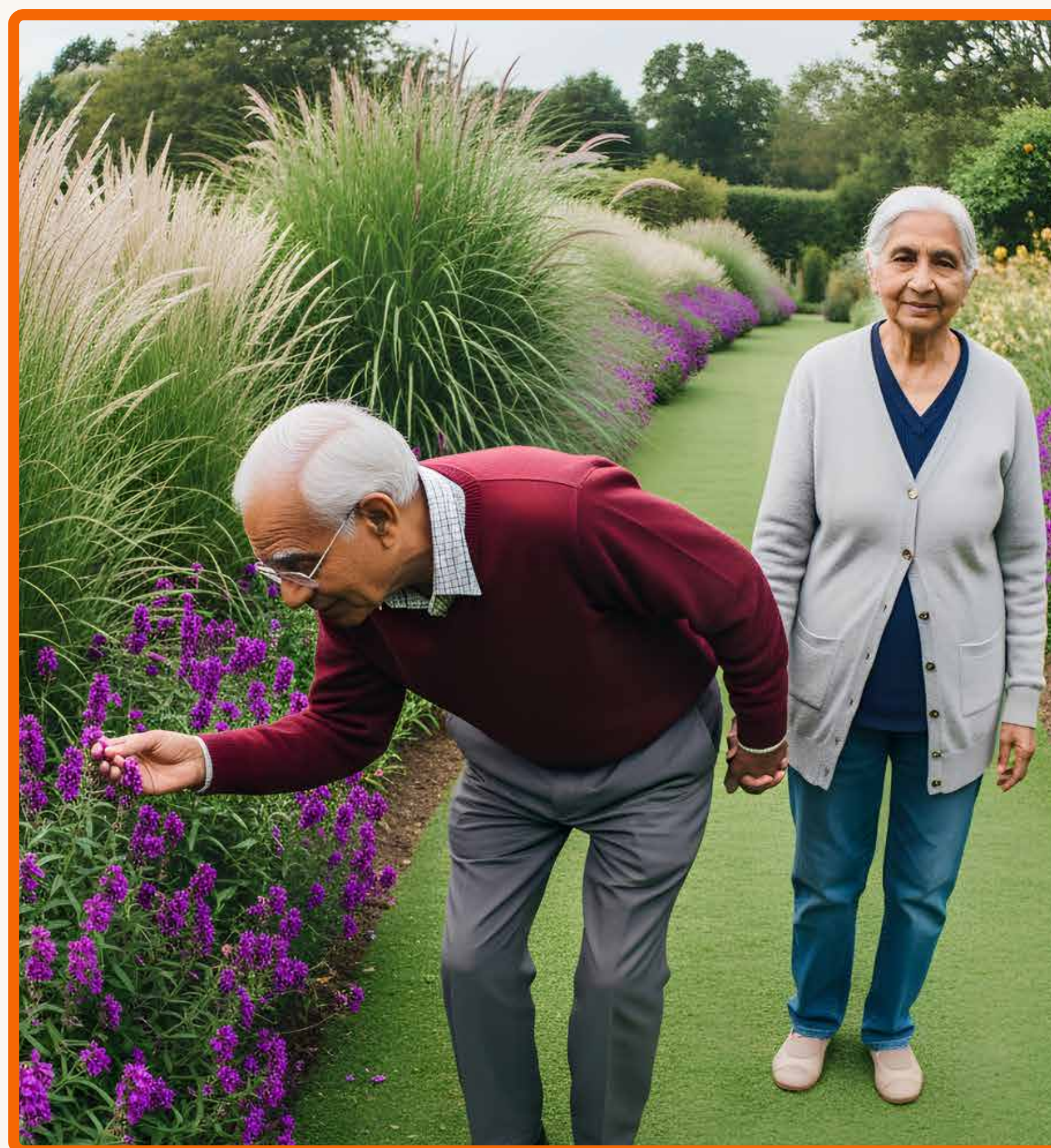
Green Wellness Living