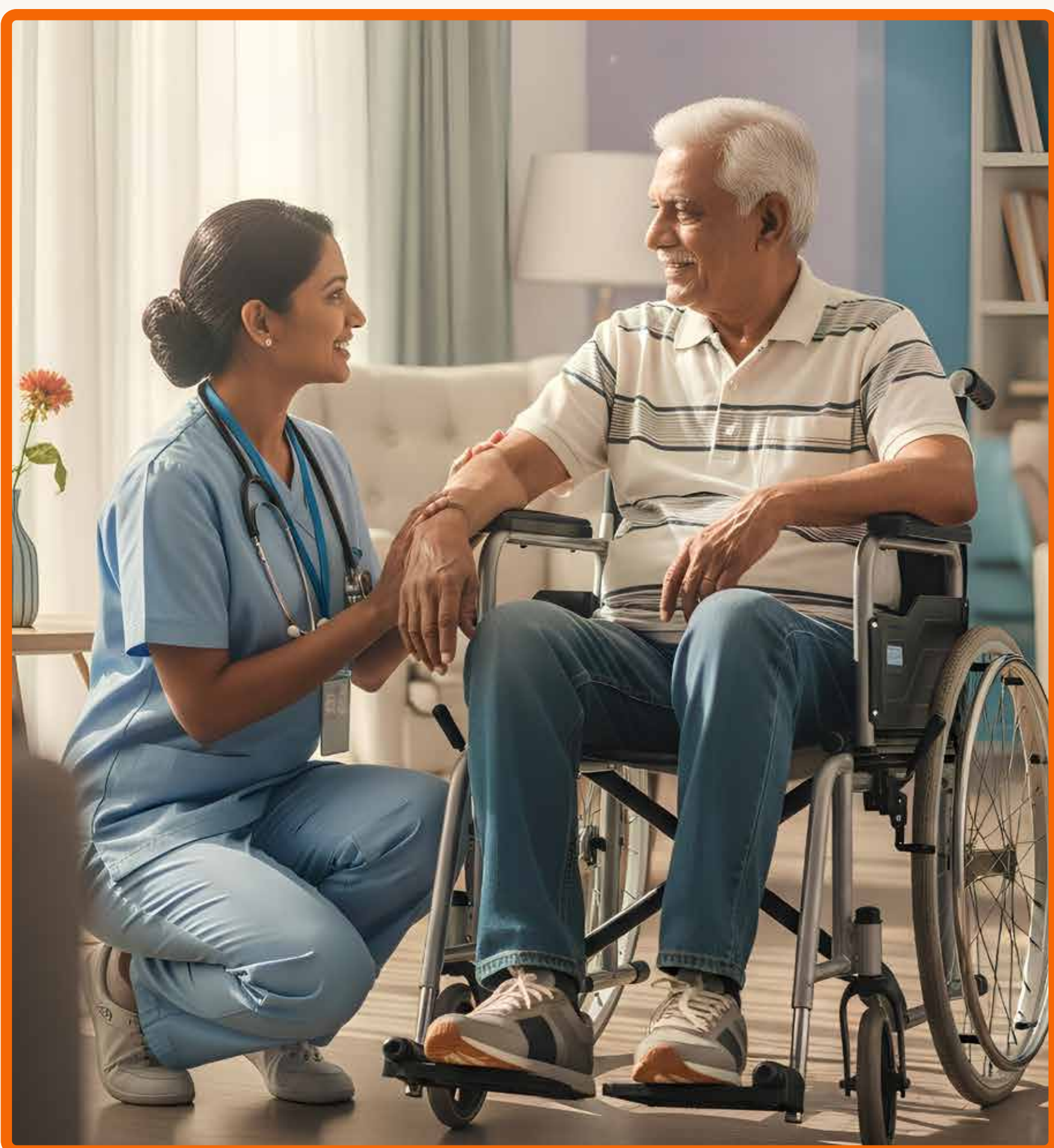
24/7 Medical Support